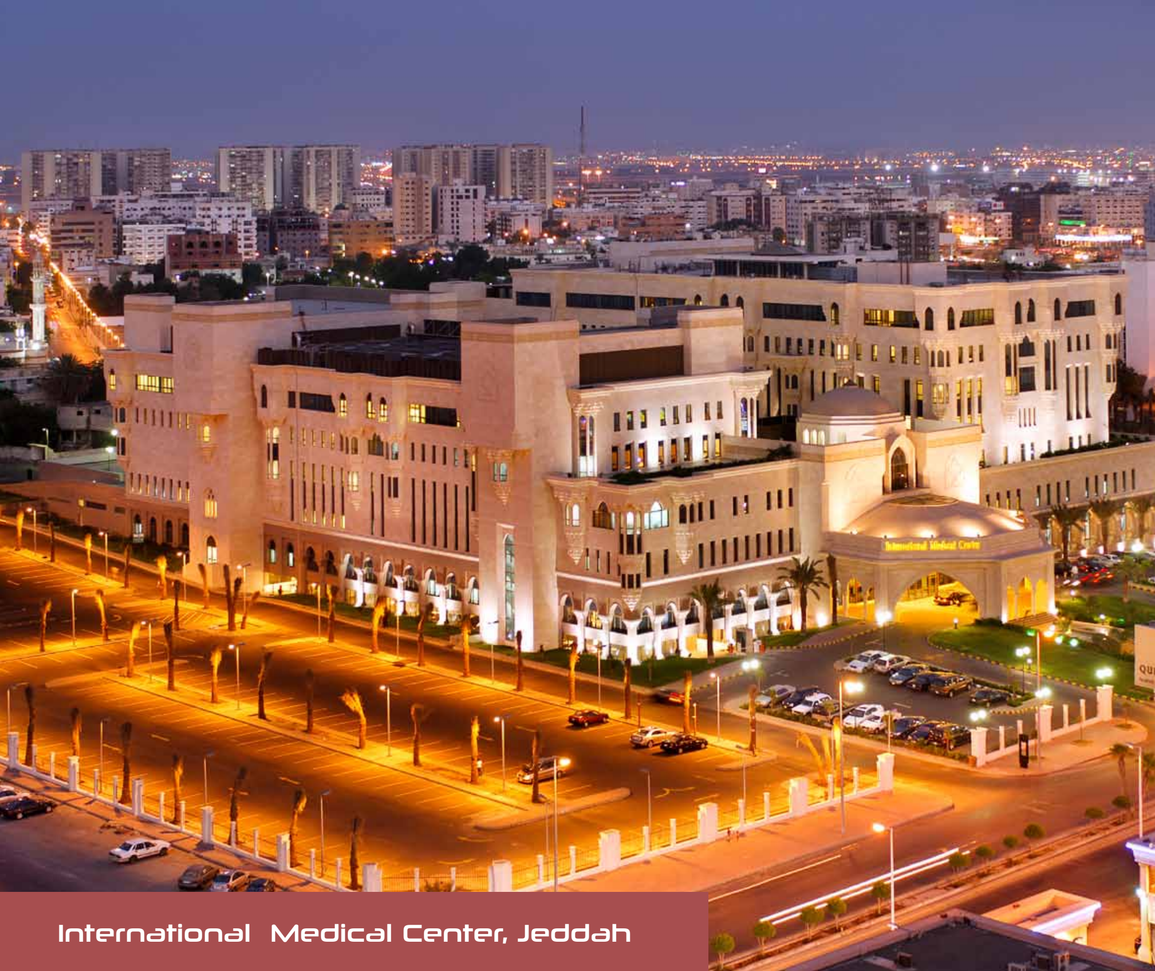
International Medical Center, Jeddah

Kingdom of Saudi Arabia is regarded, at the Arab Countries level, as a pioneer in offering special health care and medical services. The government works hard to increase the number of hospitals, which offer the patients quality service. There are many university and government hospitals as well as specialized ones. The existence of complex specializations, in the medical field, required the necessity of having specialized centers for offering high-level medical service, which is reflected in the health of individual and society. SAK along with Amar Center was commissioned to design this landmark hospital complex.